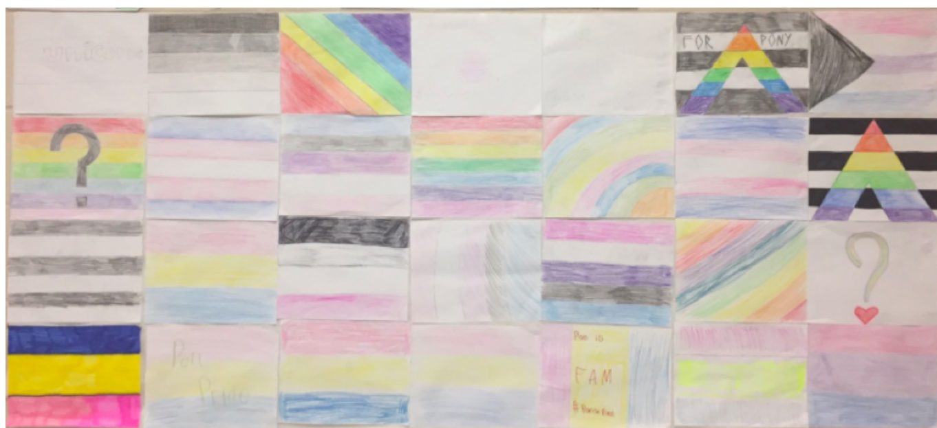
Figure 1. Compilation pride flag colored by GSA students.

Because of the issues the previous year, I took a photo of the finished flag (Figure 1) and sent it to the principal for approval prior to hanging. Once we had that approval, it went up in a large blank space of the math hallway (somewhere we knew all students would pass at some point in their day). Two days later, my colleague and I were asked to meet with the principal during our lunch period. I felt sick to my stomach because I knew what the outcome of that meeting would be—the flag was coming down.