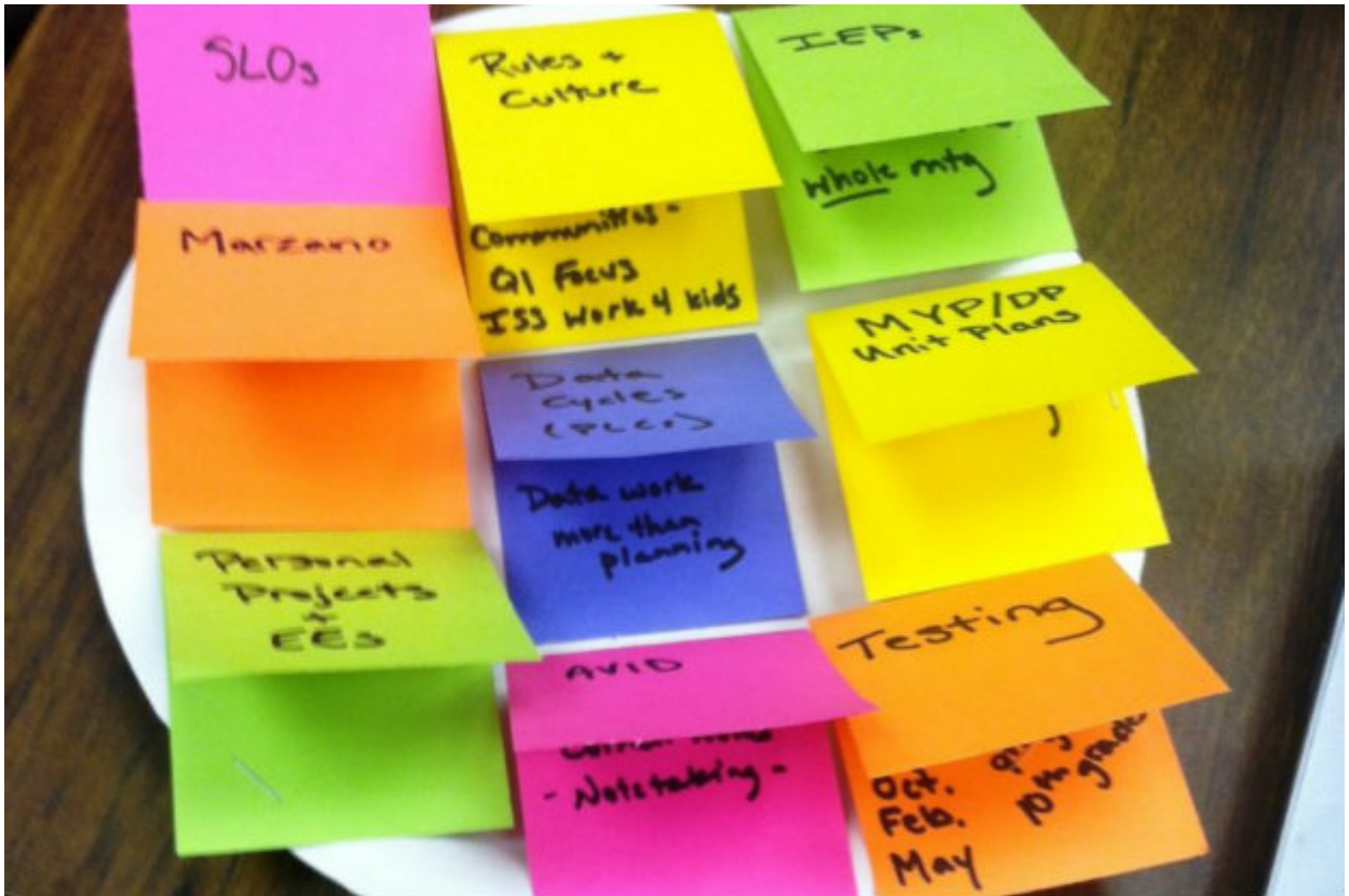
Figure 1: A representative depiction of demands on teacher time.

To represent the demands on teacher time, I took a paper plate and stapled little colorful pieces of paper to the plate. On each piece of paper I wrote a single focus for the year. I meant for this plate to be a creative way to communicate with my department about the many things “on our plate” this year. The plate became a tangible way to discuss threats to morale throughout the year. Each thing on the plate, taken in isolation, is something that could be good for student learning. However, the plate as a whole was so full that each component lost its power. Plus, teachers had little power in choosing what was on the plate, and this lack of autonomy added to overwhelming feelings of discouragement. Morale in my department was crushed by heavy demands on teacher time, coupled with a feeling that teachers’ strengths went unnoticed.