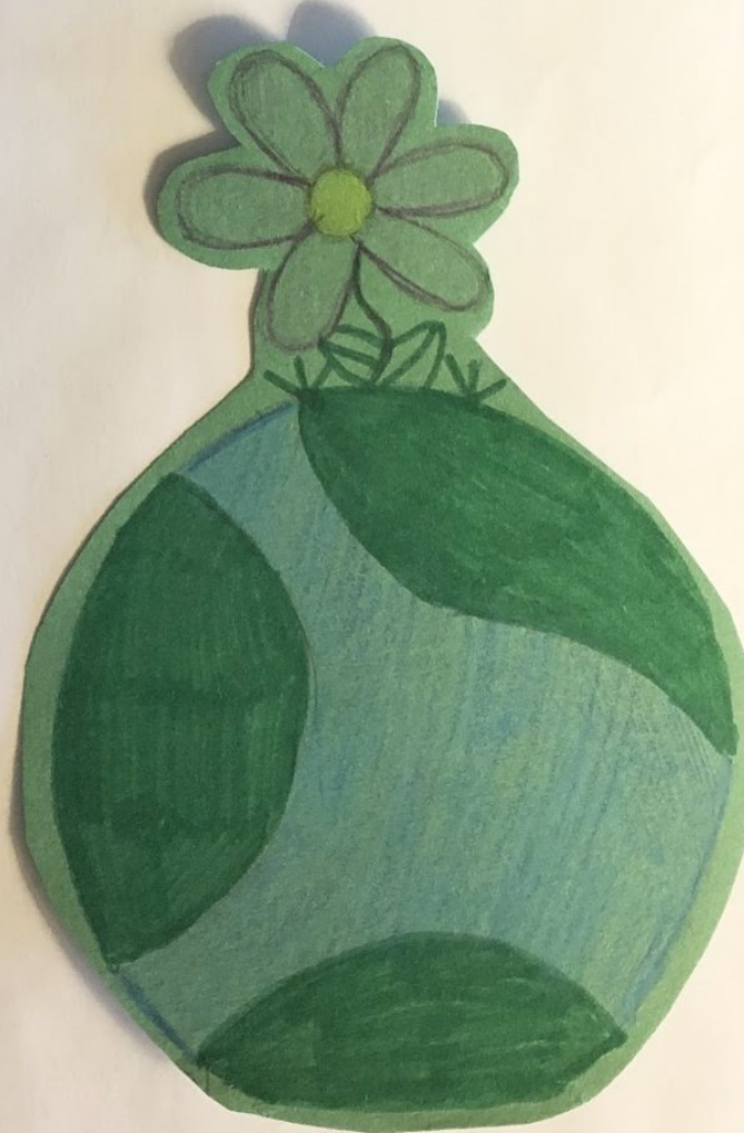
Figure 2. Student Nature Nook Book with Student Drawing.

After we arrived at the grove, I asked my students to use their nature nook book to