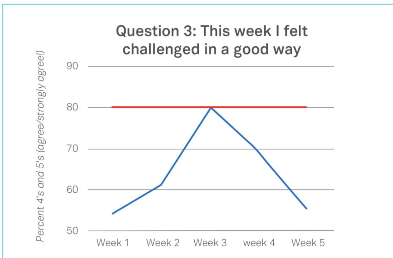
Figure 4. Sarah’s students’ perception of challenge from week 1 to week 5. Students reported a drop in their perception of challenge in Sarah’s math class from Week 3 to Week 5.

The students provided insight to me that, because they didn’t learn anything “new” and instead were just revising old work, the week didn’t “feel” hard. I was able to not only explain the rationale for having weeks like this, but also hear from them about how we could ensure that their brains were still working hard (like having a warm-up with a new idea or a short lecture at some point during the week).